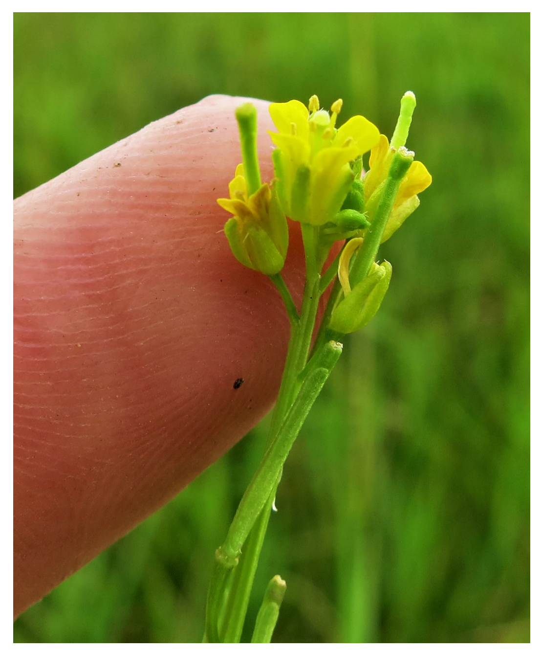
FIGURE S4. Small-flowered Wintercress (Barbarea stricta), with relatively short petals (<4.5 mm long).