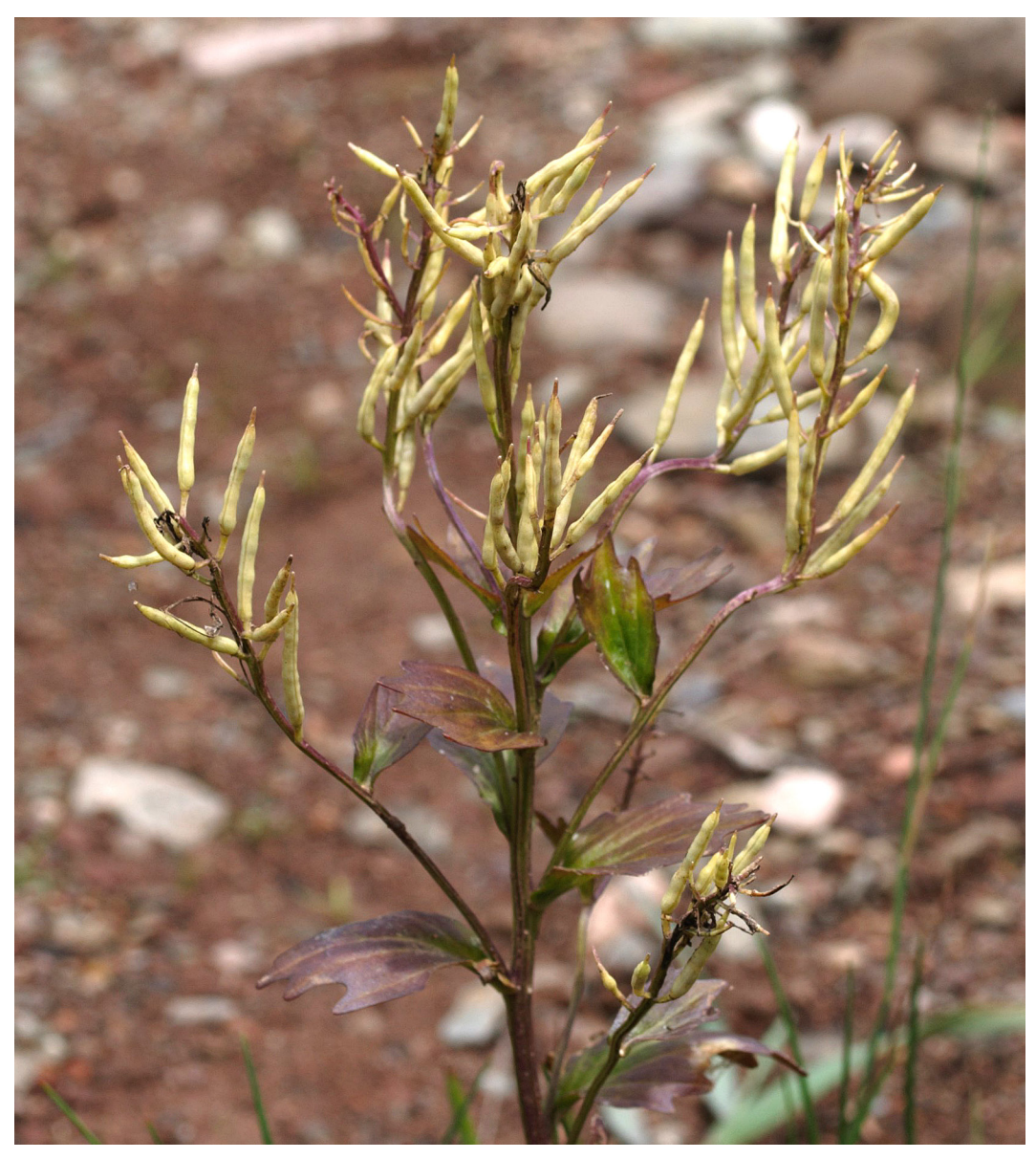
FIGURE S1. Bitter Wintercress (Barbarea vulgaris), with characteristic slender, relatively long stylar beaks (>1.5 mm long) and spreading siliques.