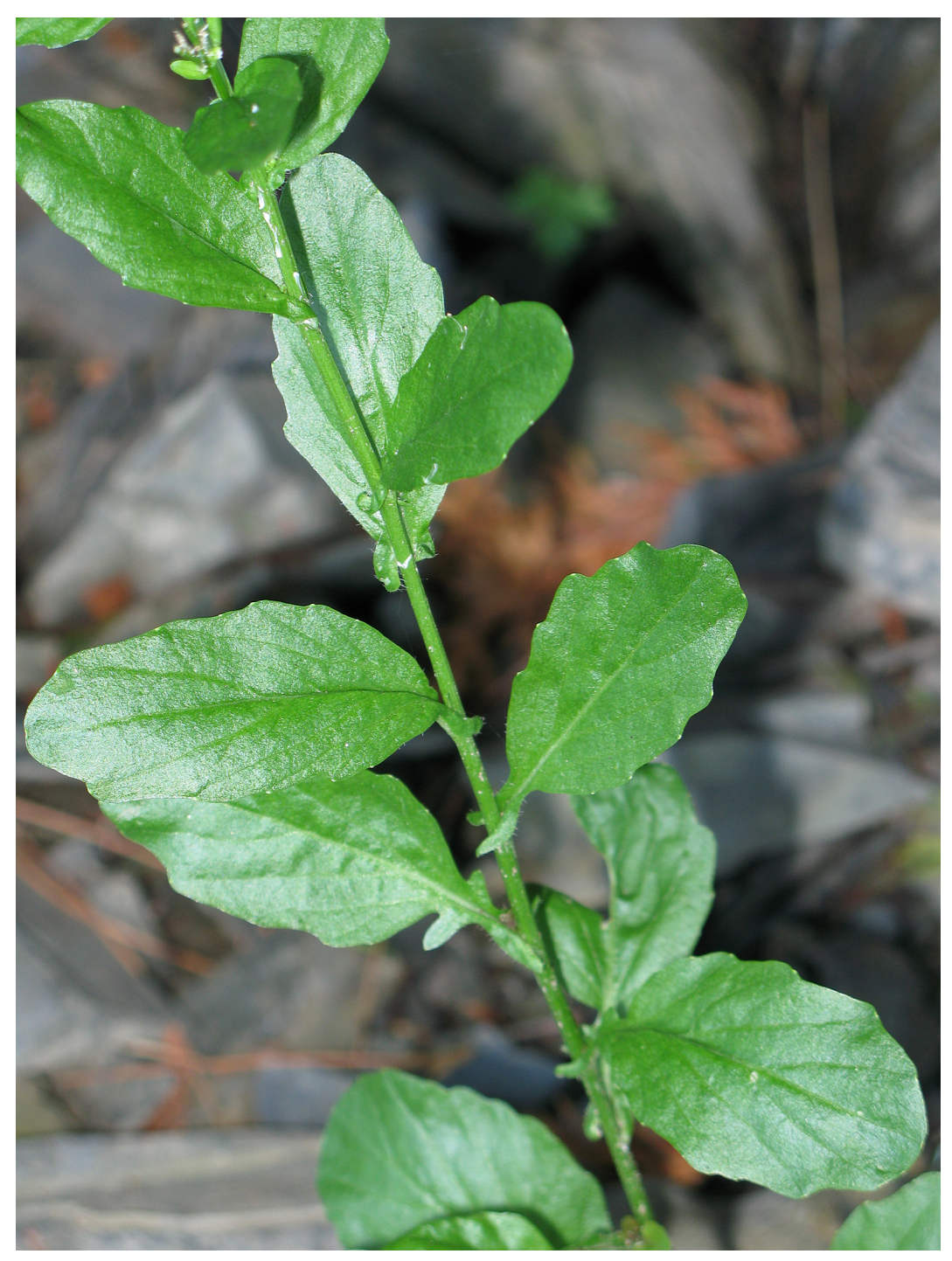
FIGURE S3. Small-flowered Wintercress ( Barbarea stricta ), with dentate upper stem leaves and ciliate auricles.