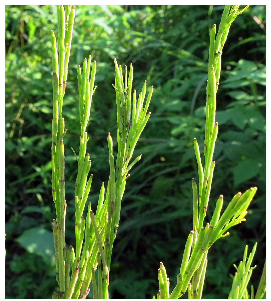
FIGURE S2. Small-flowered Wintercress ( Barbarea stricta ), with short and stout stylar beaks (<1.5 mm long) and appressed siliques.