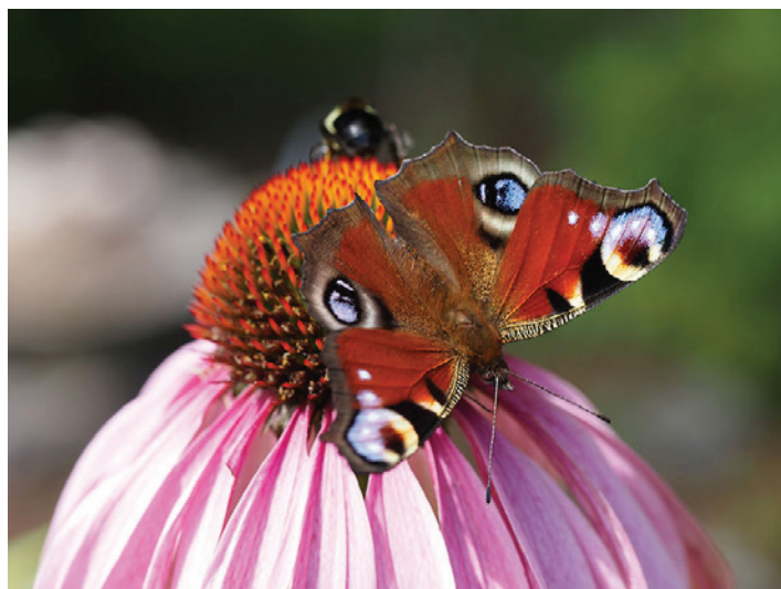
European Peacock - Photograph by Peter Payzant

Wagner of Maine. Ocola Skipper is a southern species with a permanent range that covers much of Latin America and the extreme southern United States. Some migrate north annually, and it regularly occurs as far north as Virginia. In Canada this species is extremely rare, having only been recorded in southern Ontario. The nearest records to the Maritimes are from Massachusetts, about 400 kilometers from Campobello Island! The Campobello record is the furthest north the species has ever been recorded.