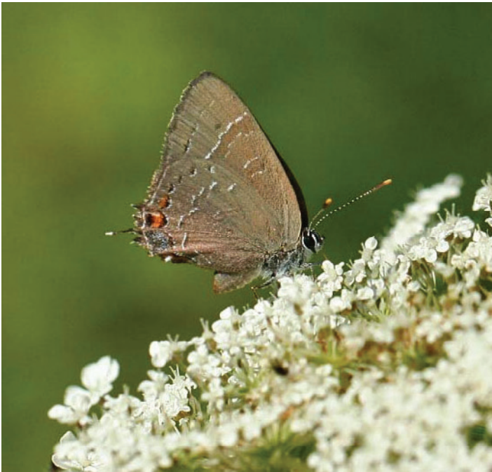
Banded Hairstreak

of the Halifax European Peacock is impossible to know with certainty, but it seems unlikely to be a natural occurrence. The individual in the Evers' garden was extremely fresh, suggesting that it did not fly there from Montreal. It was most likely brought into the Halifax area as a pupa on a shipping container. There is a remote chance that a population could become established in the Halifax area; however, that too seems unlikely, as the species' host plant, Stinging Nettle ( Urtica dioica ), is not common in the region.