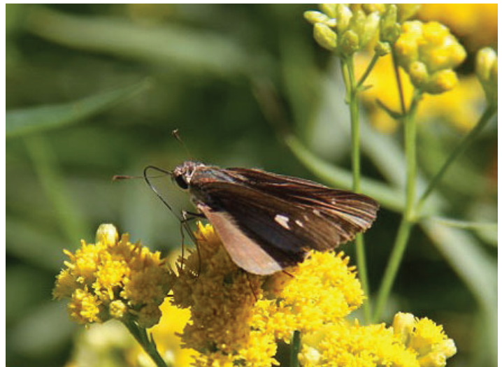
Ocola Skipper

An Ocola Skipper was photographed on Campobello Island on August 19 by Marcy