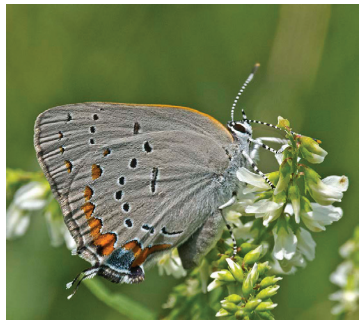
Acadian Hairstreak - Photograph by Phil Schappert

2014 was a really good year for our other hairstreak species. Of the 81 MBA records of Acadian Hairstreak ( Satyrrium acadica ), Striped Hairstreak ( Satyrrium liparops ), Banded Hairstreak ( Satyrrium calanus ), and Gray Hairstreak ( Strymon melinus ), 39 were recorded in 2014. The abundance was most notable in Acadian Hairstreak – 14 of the 20 records of that species are from 2014. The species is now recorded in 10 squares – prior to 2014 it had